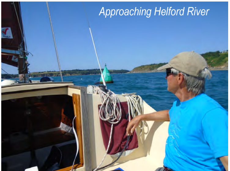
Approaching Helford River