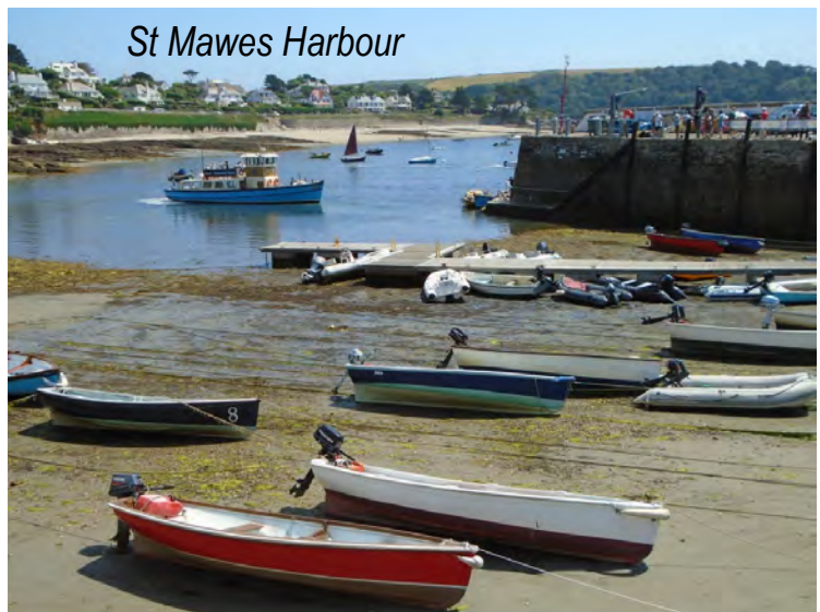
St Mawes Harbour