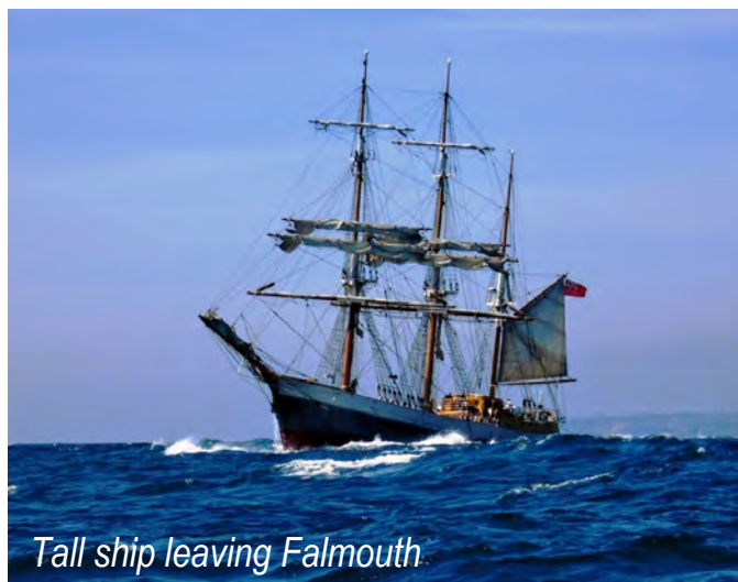
Tall ship leaving Falmouth

Leaving Polkerris, we were sheltered at first by the Gribbin headland to the east but once clear we had a splendid easterly breeze to drive us SE towards Falmouth, and a super rollicking sail for some 15 miles. The waves built up and a tall ship outward bound from the Fal was pitching noticeably. Closer to St Anthony Head the seas became still steeper, so it was a relief to sail in to shelter, and anchor in flat water with the gusts passing overhead. A very satisfying passage.