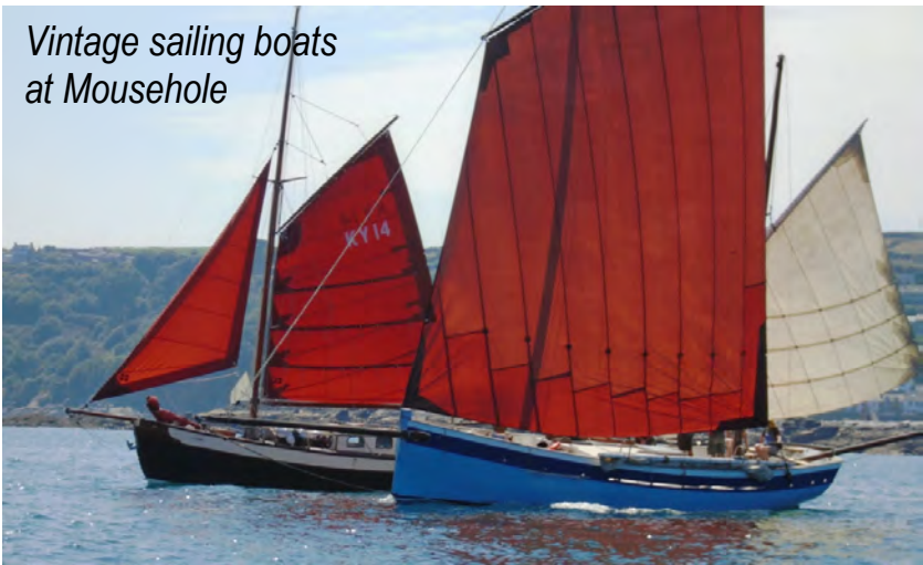
Vintage sailing boats at Mousehole

A further six miles and we reached Mullion Cove in very light airs and a flat sea. It was a lovely anchorage but after lunch I realised I was missing a rare opportunity to go still further west. Motoring more than sailing, we crossed the ten empty miles of Mount's Bay and reached Mousehole, just south of Penzance and Newlyn.